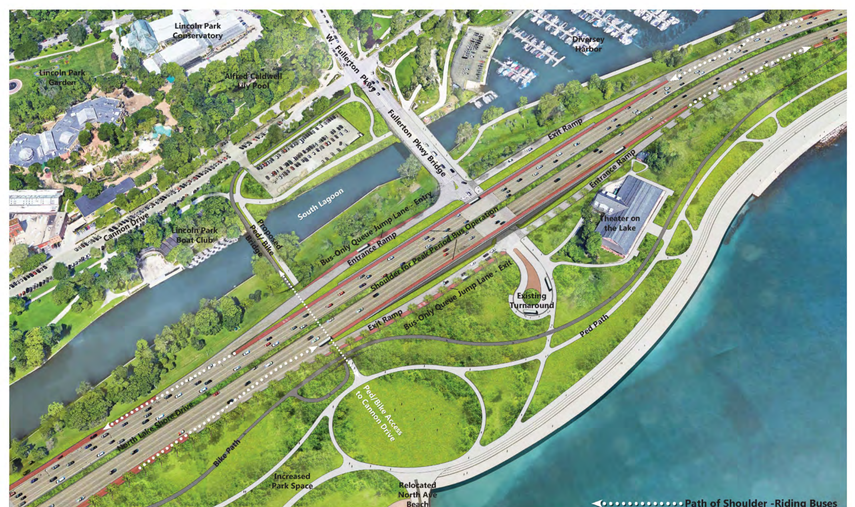
Option 3 - Dedicated Transitway on Left Side